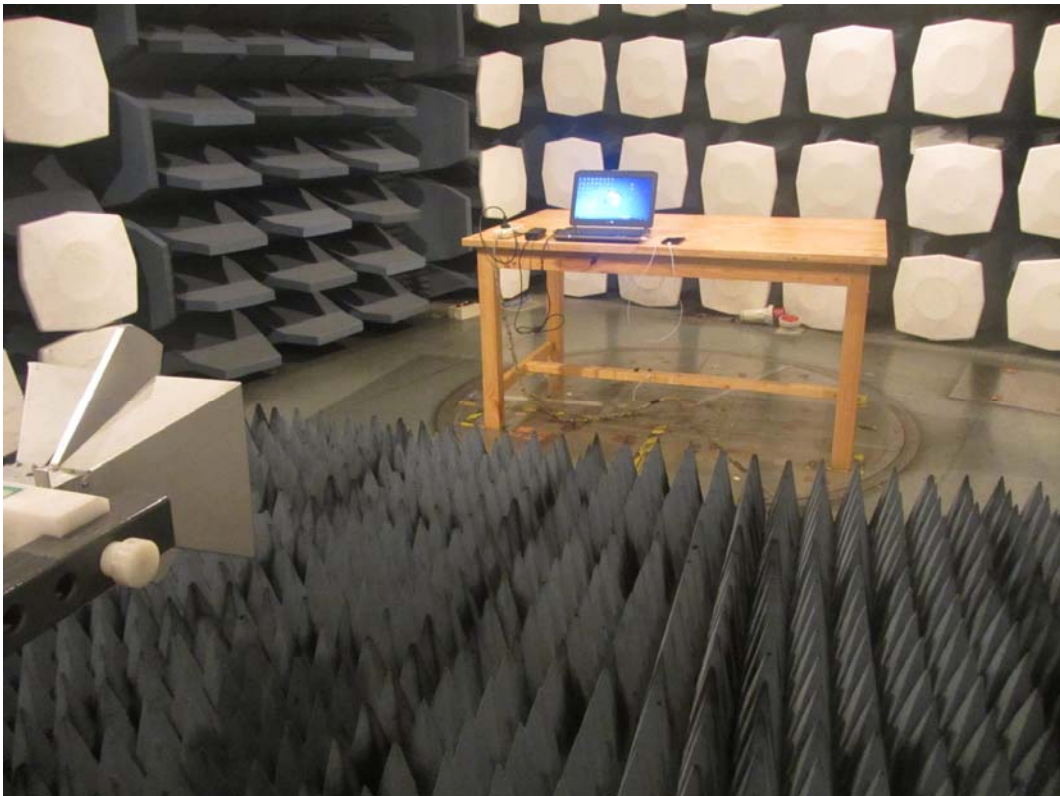
b: Above 1GHz