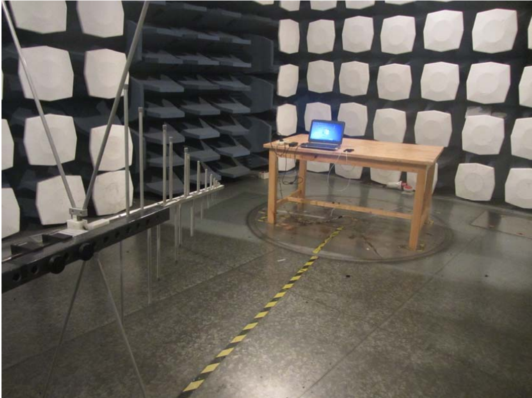
a: Below 1GHz