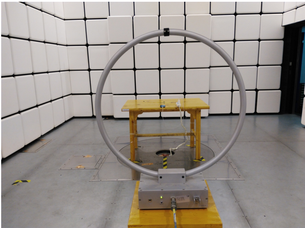
9KHz - 30MHz