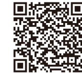
Cool Shot App for Android

The earbuds can work with a “Selfie” app that connects to your smart phone and allows you to take camera photos using the earbud controls. Scan the QR codes below to download the app from the Google Play Store or Apple App Store.