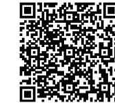
CSR Easy Click App for Apple