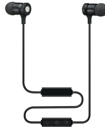
Bluetooth Earphone User's Guide for Model SAEB16

Specifications are subject to change without notice. Copyright © 2016 Digital Products International (DPI, Inc.) All other trademarks appearing herein are the property of their respective owners.