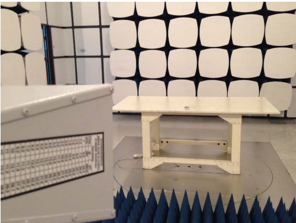
RE Above 1GHz