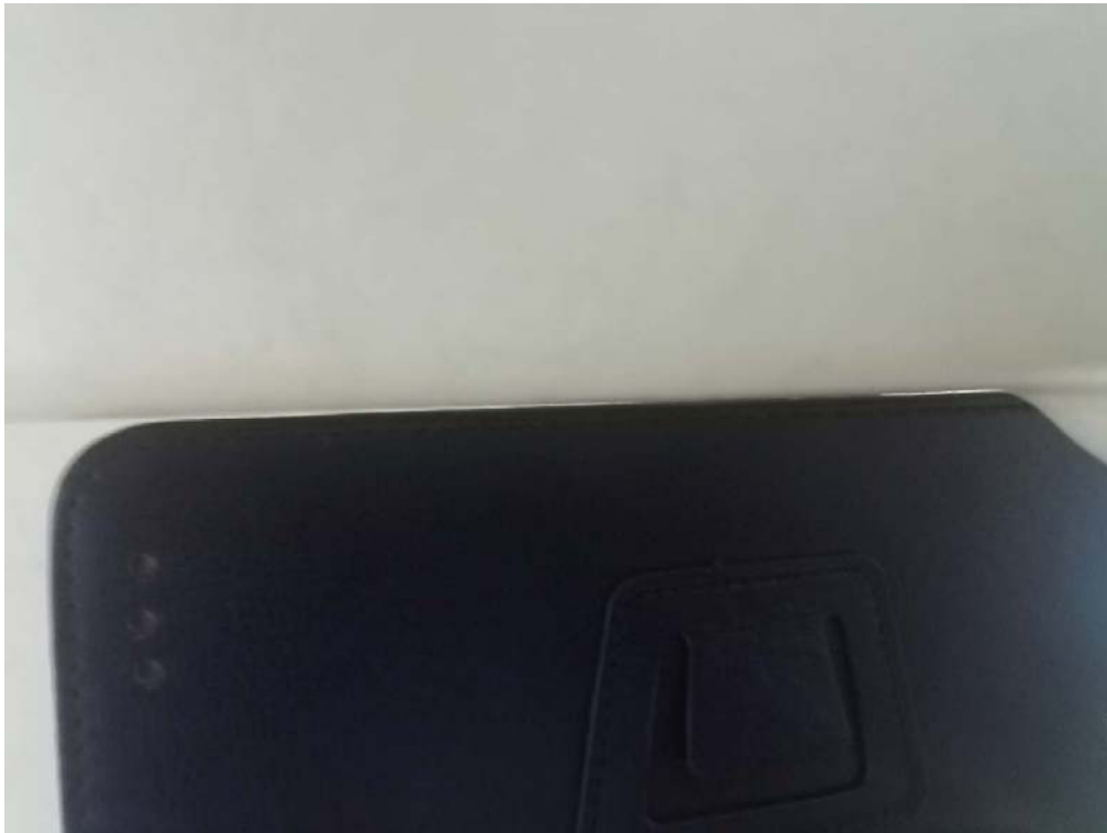
Body-worn Bottom Setup Photo (0mm)