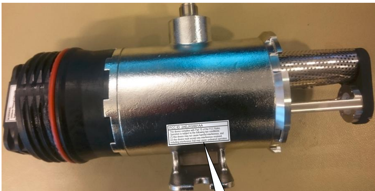
GS01 – external antenna