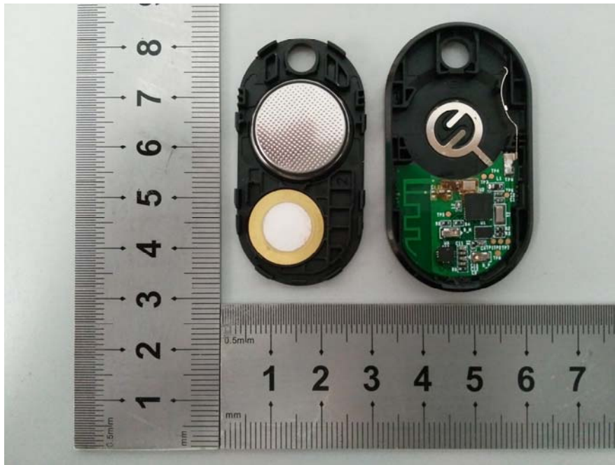
EUT – Cover off View-2