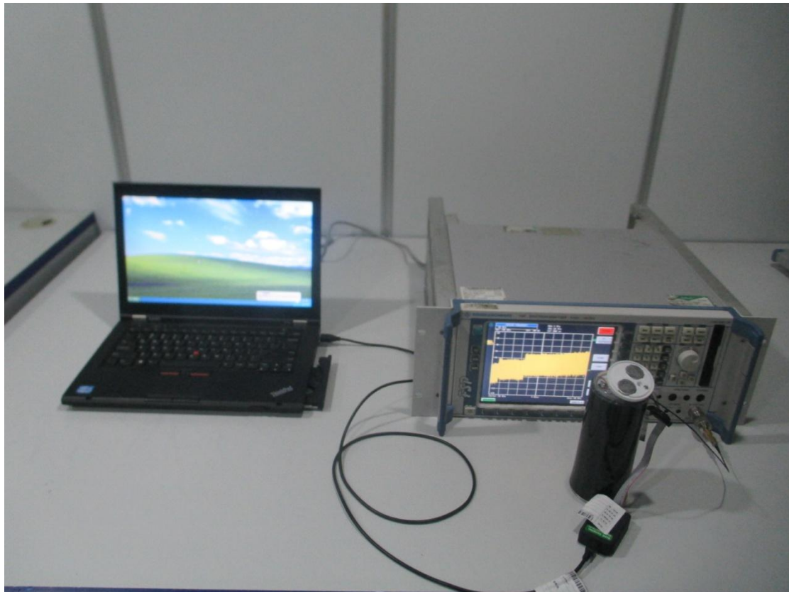
Conducted Test setup photo