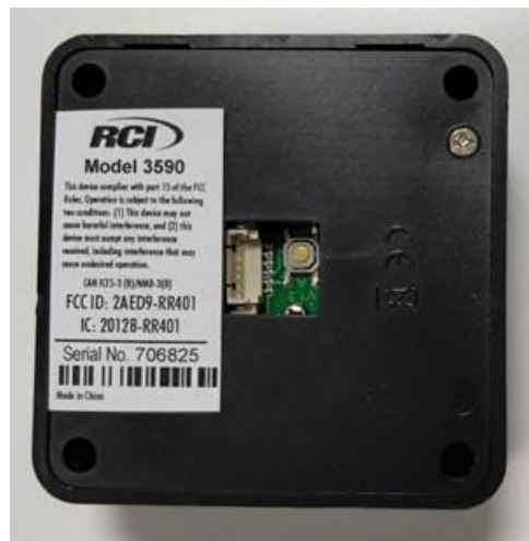
Figure 2 – Label Location