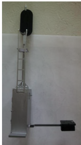
Exterior Top View