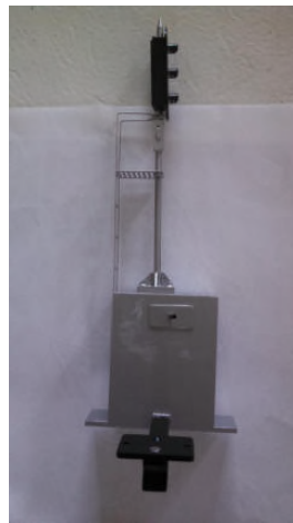
Exterior Left Side View