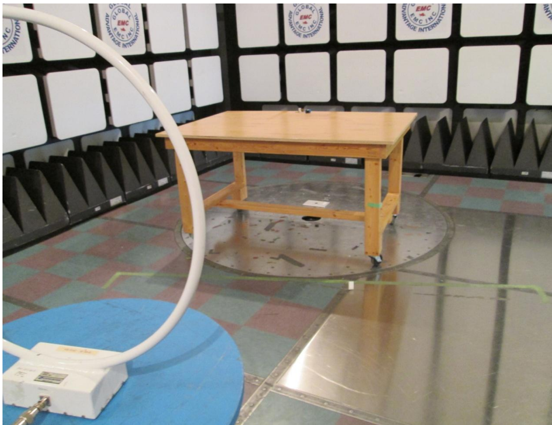
Radiated Emissions Photo 1