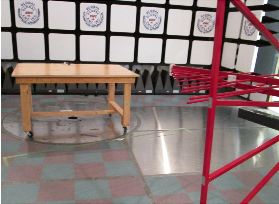
Radiated Emissions Photo 2