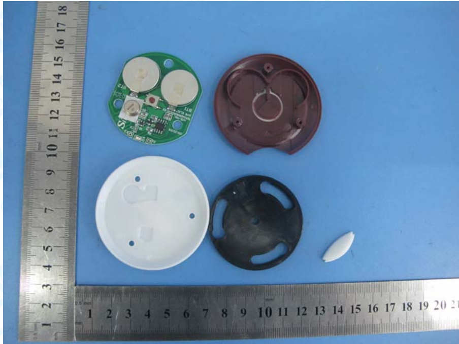
Photo 4 Internal of EUT