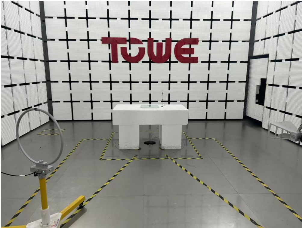
Field Strength of Spurious Radiation – 9kHz to 30MHz