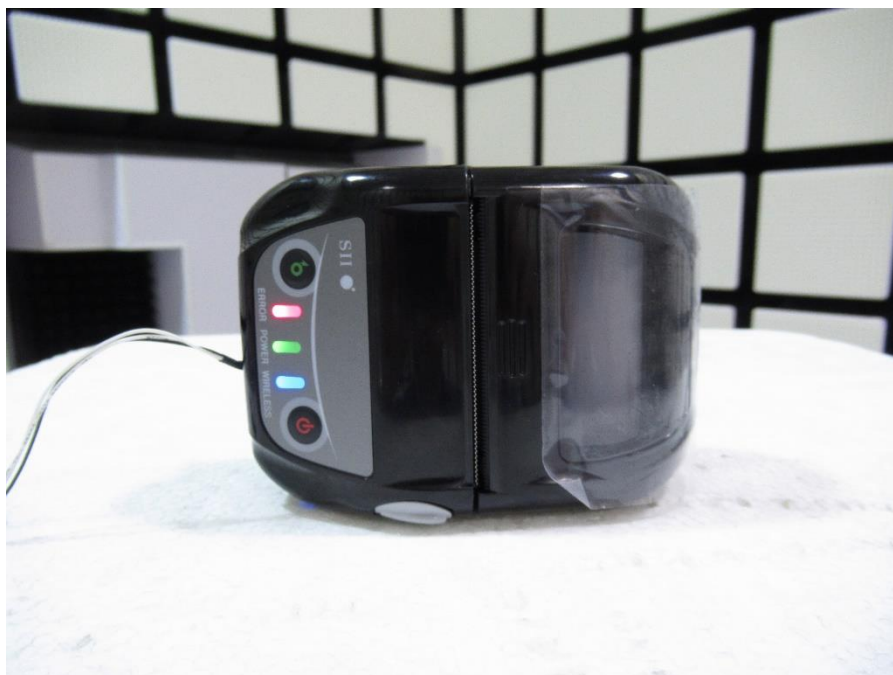
– Y axis –