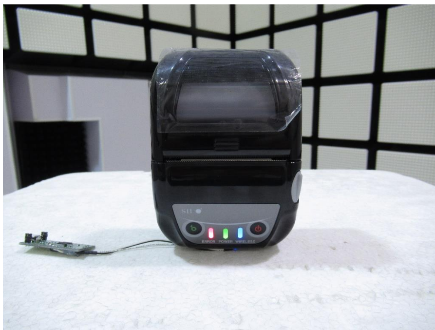
– Z axis –