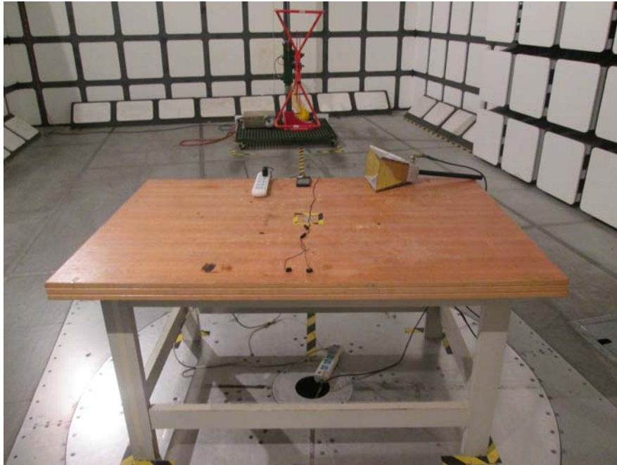
Radiated Emissions –Side View (30-1000 MHz)