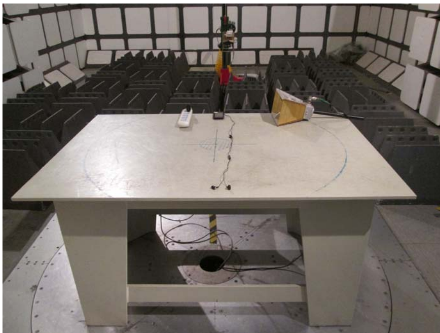
Radiated Emissions –Side View (1-25 GHz)