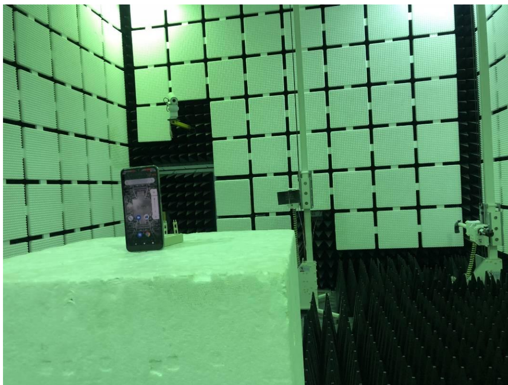
Fig. 2 (Above 1GHz)