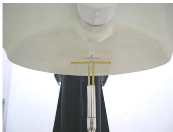
Fig 8.3.2 Setup Photo