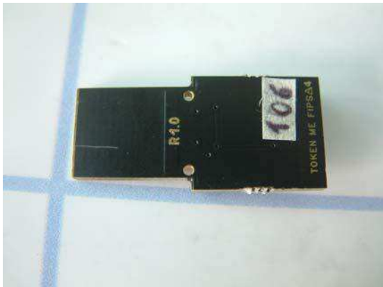
PCB side 2 view

Copyright of this report is owned by Centre of Testing Service and may not be reproduced other than in full except with the written approval of the issuing Company.