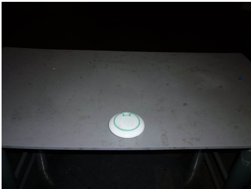
Setup for radiated emission