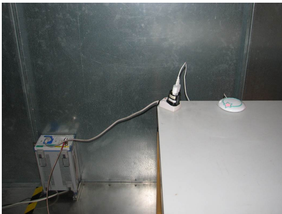
Setup for AC mains conducted emission