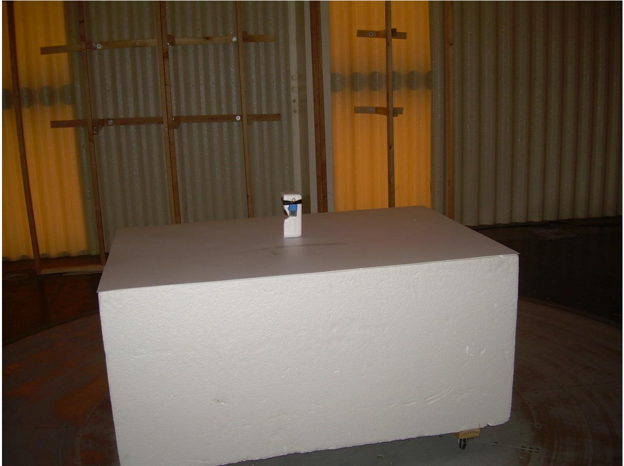
Front View Radiated Emissions 9 kHz to 1000 MHz Range – EUT Vertical