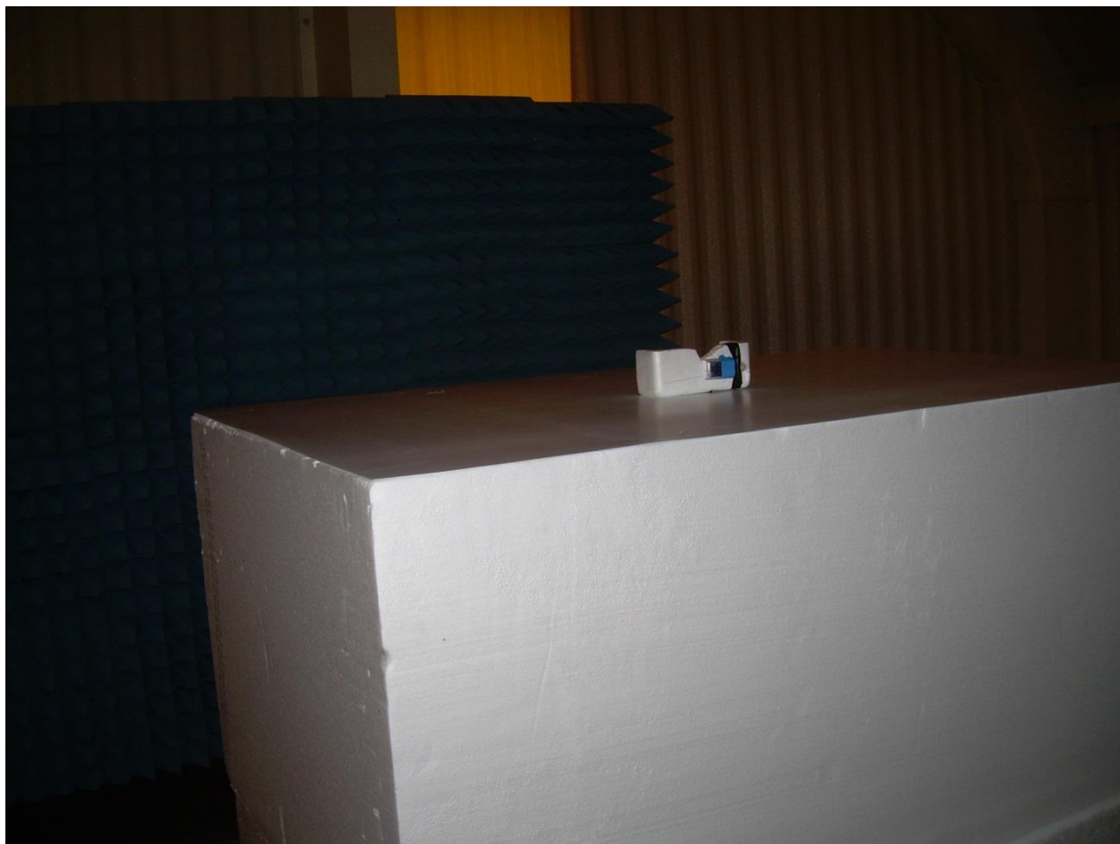
Front View Radiated Emissions Above 1000 MHz Range – EUT on Edge