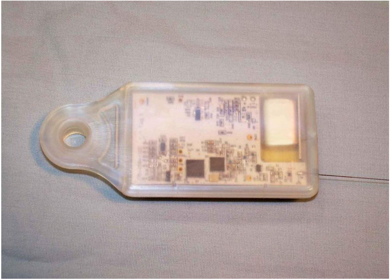
Back View of the EUT