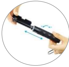
Figure for 90cm

Made of exquisite space aluminum material, super light.