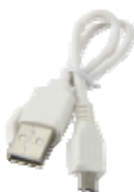
7、Free charge cable