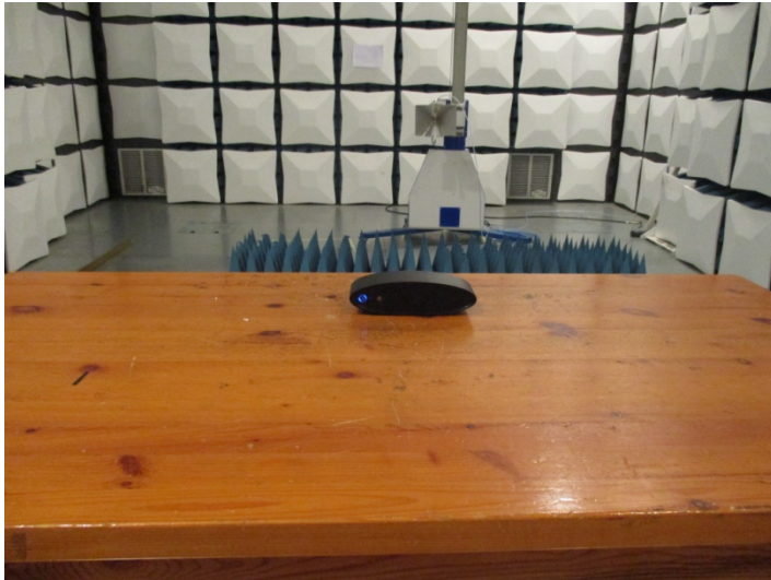
AC Power Line Conducted Emission