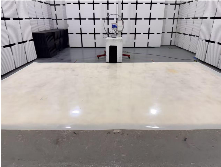
Set-up for Transmitter & Receiver Spurious Emissions, 30MHz to 1000MHz