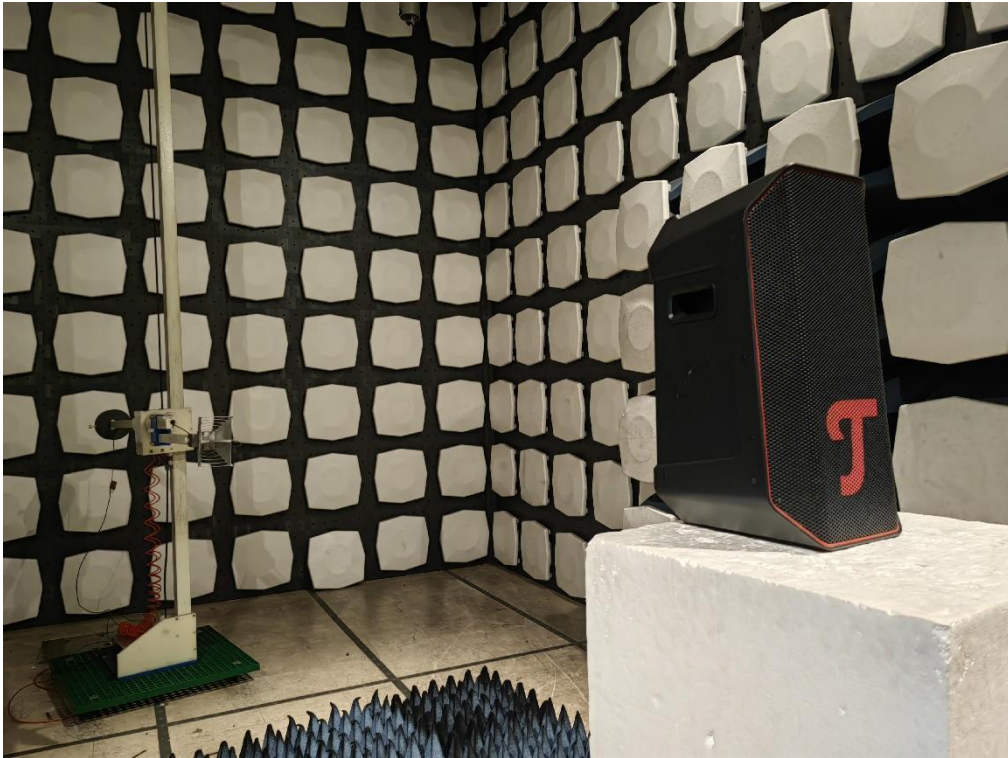
1 GHz to 40 GHz Radiated Spurious Emissions