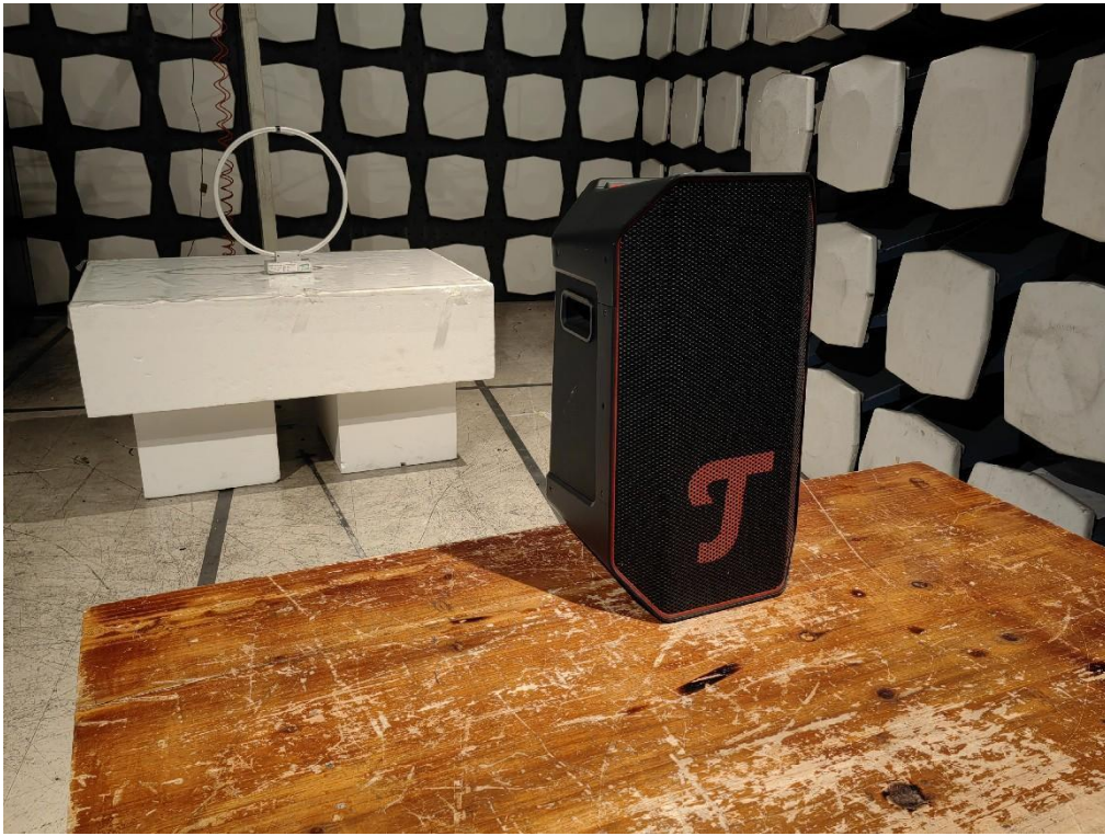
9kHz to 30MHz Radiated Spurious Emissions