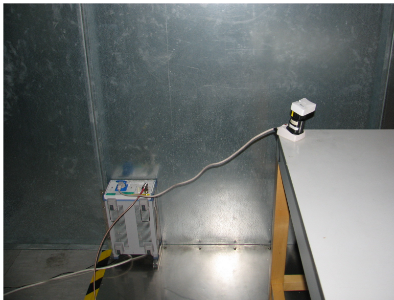
Setup for conducted emission