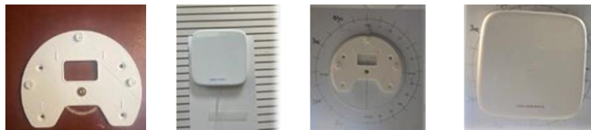
Figure 3: PowerBridge Transmitter Ceiling and Wall Mount