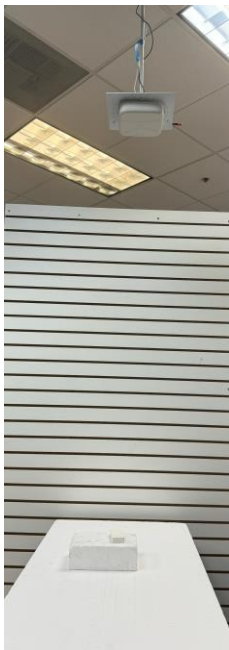
Figure 4: System Level Setup Example