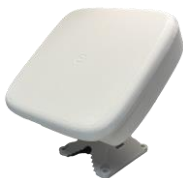
Figure 2: PowerBridge Transmitter with Stand