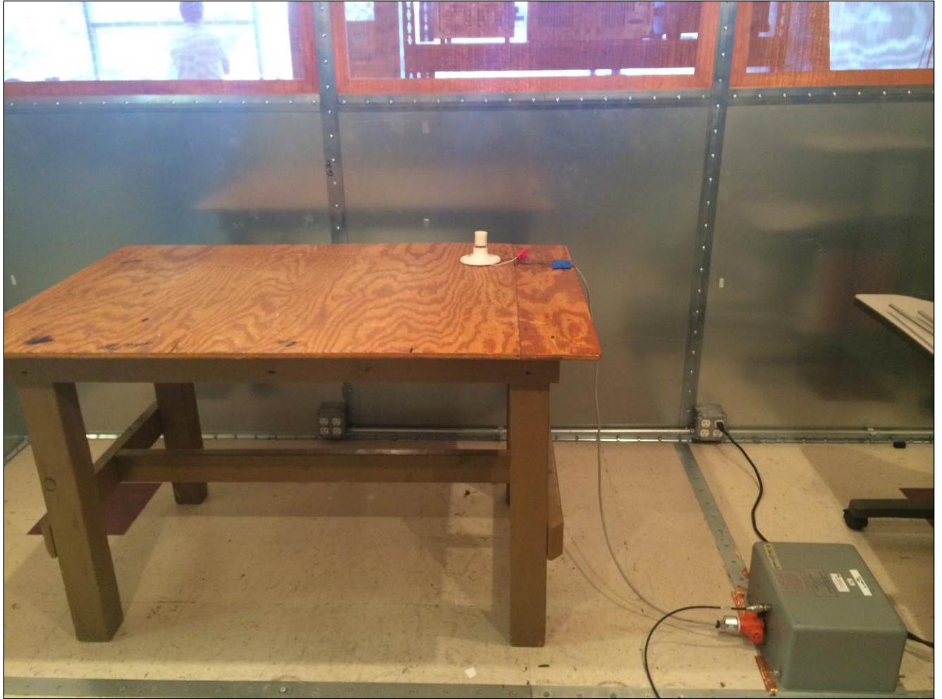
Photograph 5. Conducted Emissions, Test Setup