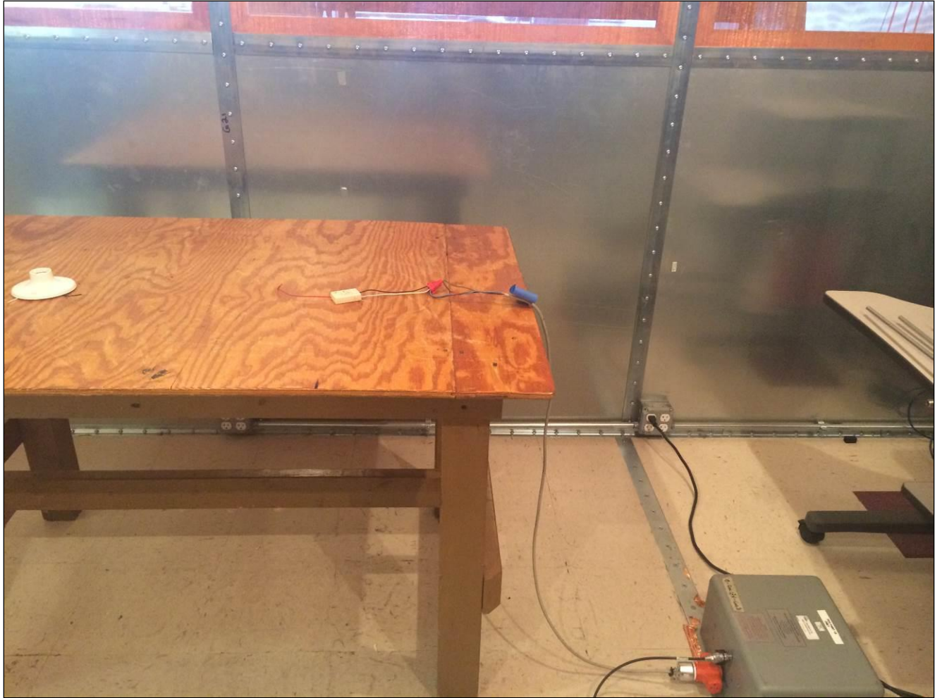
Photograph 3. Conducted Emissions, Test Setup