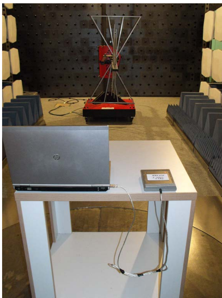
Figure 4: Radiated emission test – 30MHz to 1GHz