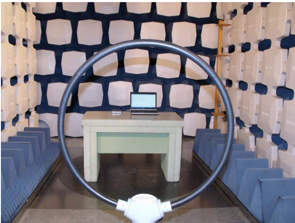
Figure 2: Radiated emission test – 9kHz to 30MHz