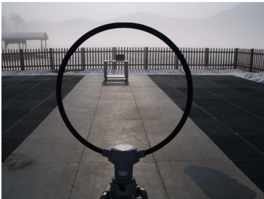
Figure 5: Radiated emission test – 9kHz to 30MHz (retested on a 10 m distance)