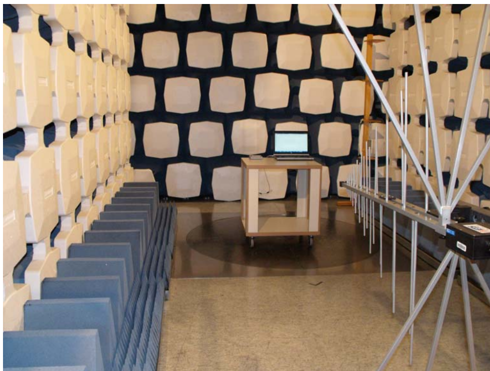
Figure 3: Radiated emission test – 30MHz to 1GHz