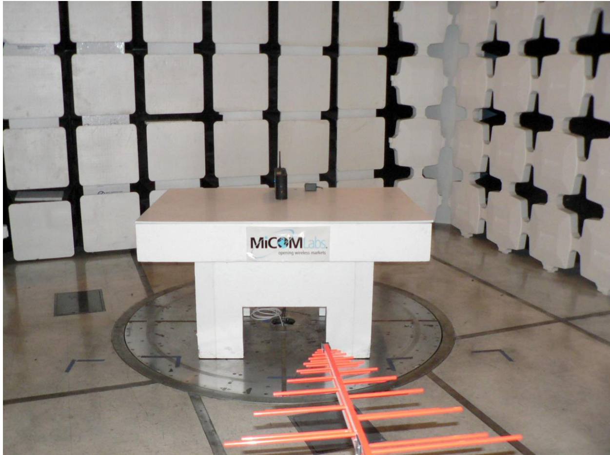
ATHO11 Digital Emissions 30-1000MHz PS

This test report may be reproduced in full only. The document may only be updated by MiCOM Labs personnel. All changes will be noted in the Document History section of the report.