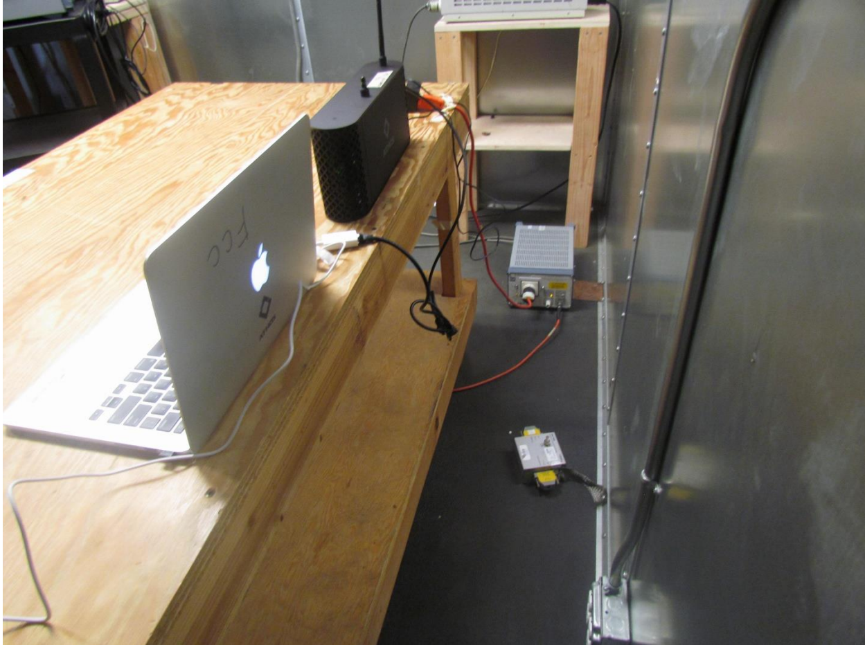
H101 Conducted Emissions AC Mains Side View