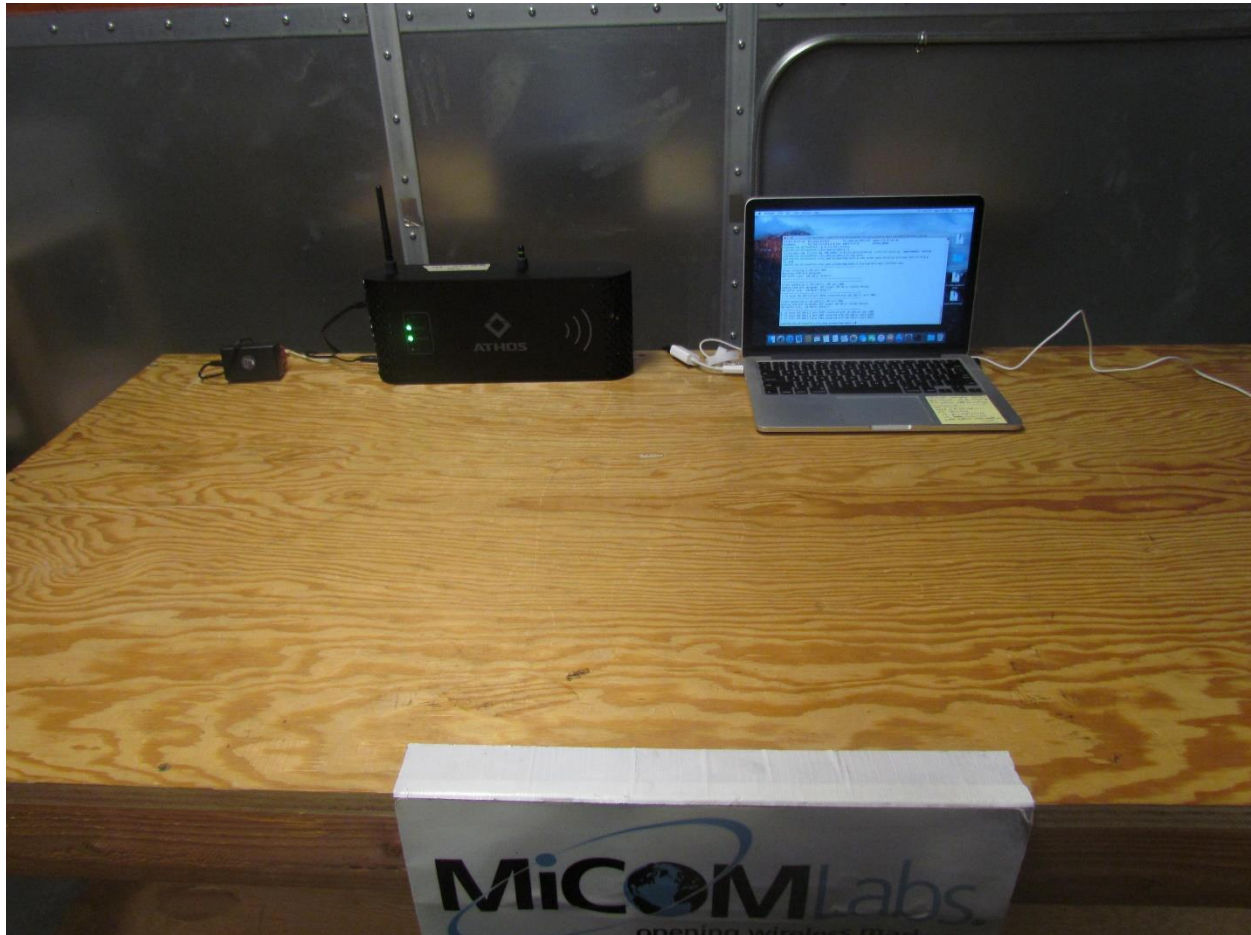
H101 Conducted Emissions AC Mains Front View