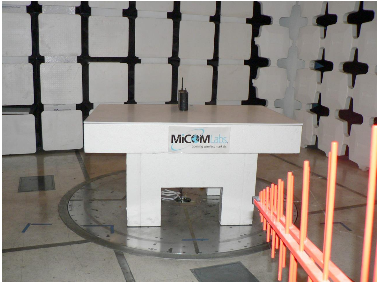
ATHO11 Digital Emissions 30-1000MHz Battery

This test report may be reproduced in full only. The document may only be updated by MiCOM Labs personnel. All changes will be noted in the Document History section of the report.