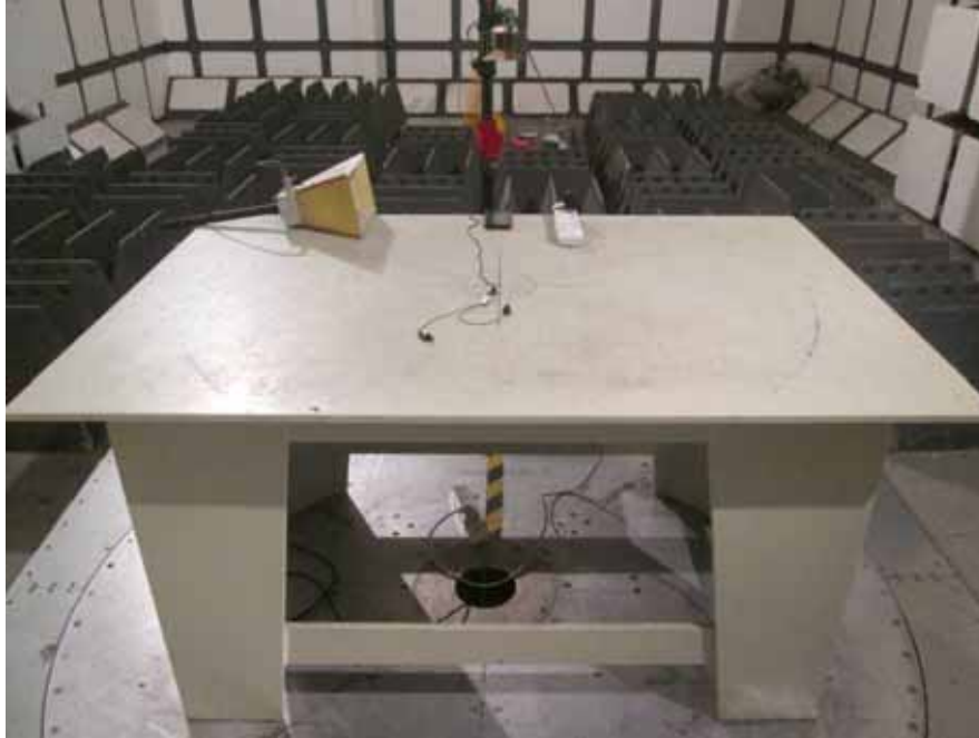
Radiated Emissions –Rear View (1-25 GHz)