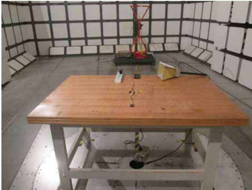
Radiated Emissions –Rear View (30-1000 MHz)