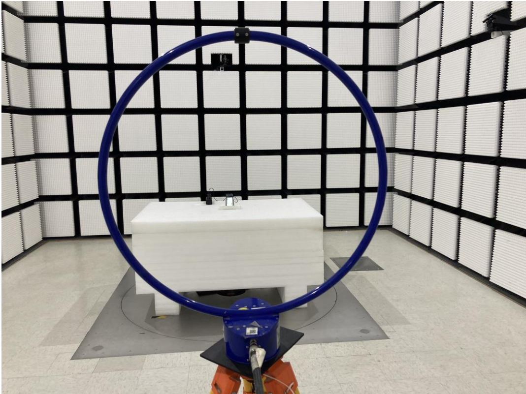
Radiated Emissions Below 1G Perpendicular View