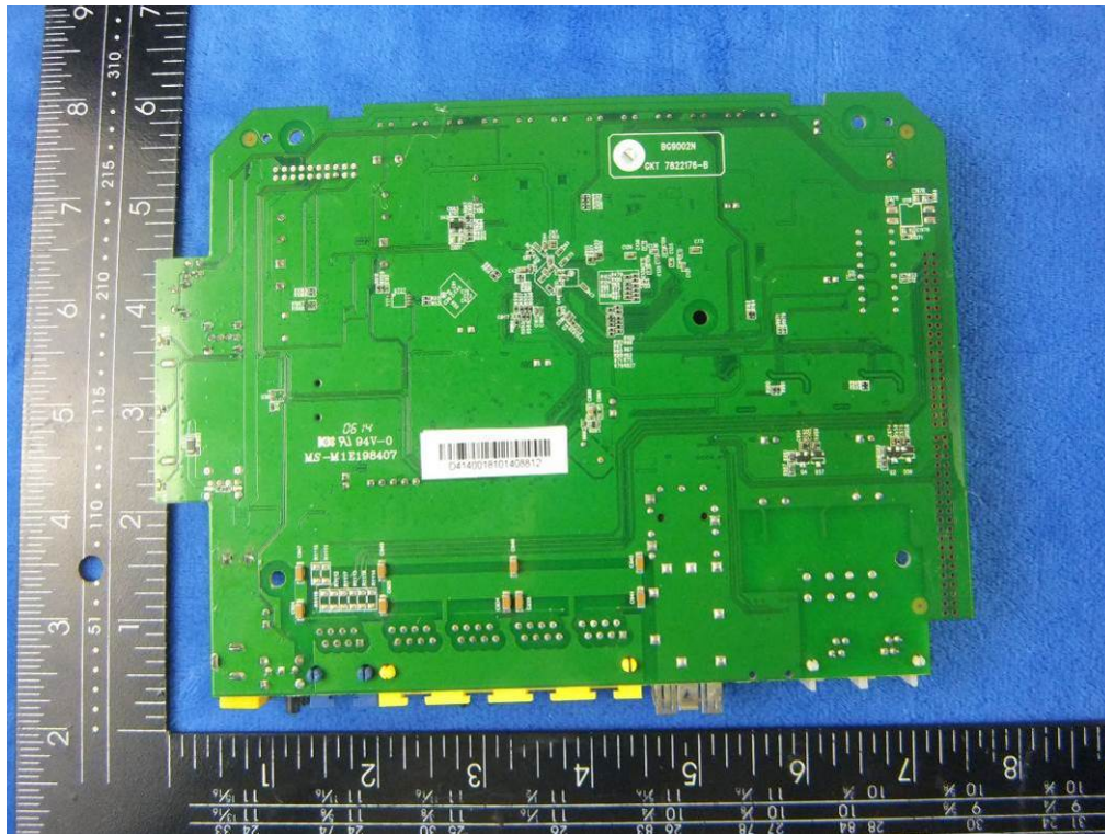
Bottom View of Mainboard