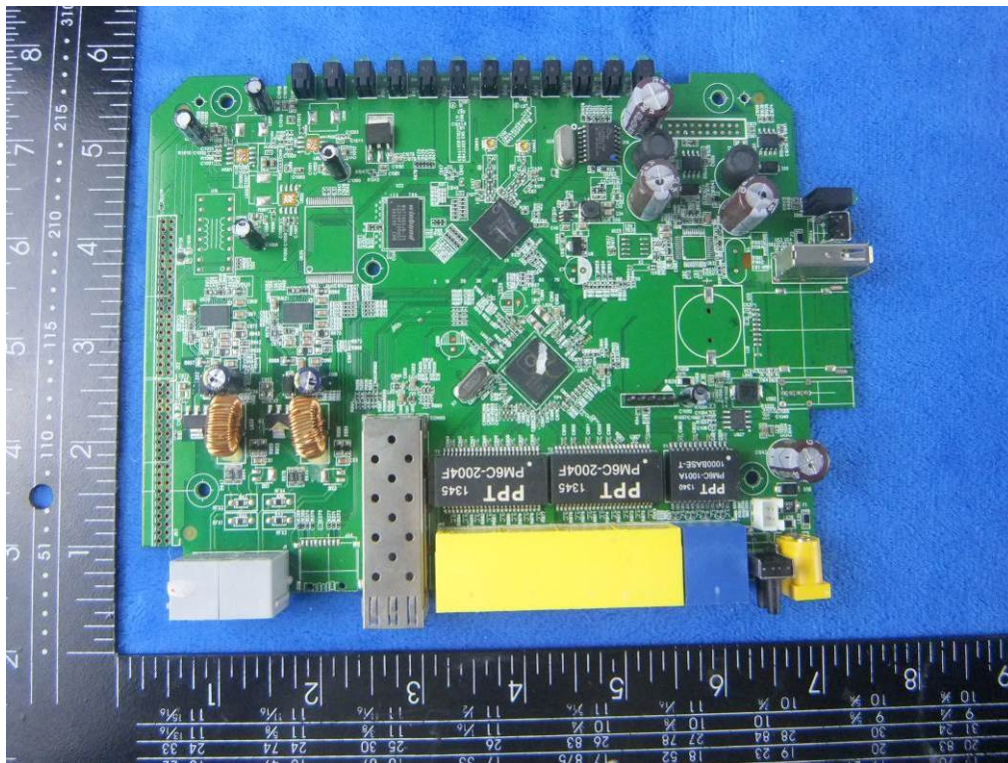
Top View of Mainboard