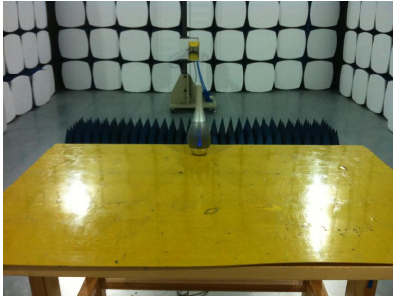
Conducted Power Line Emission