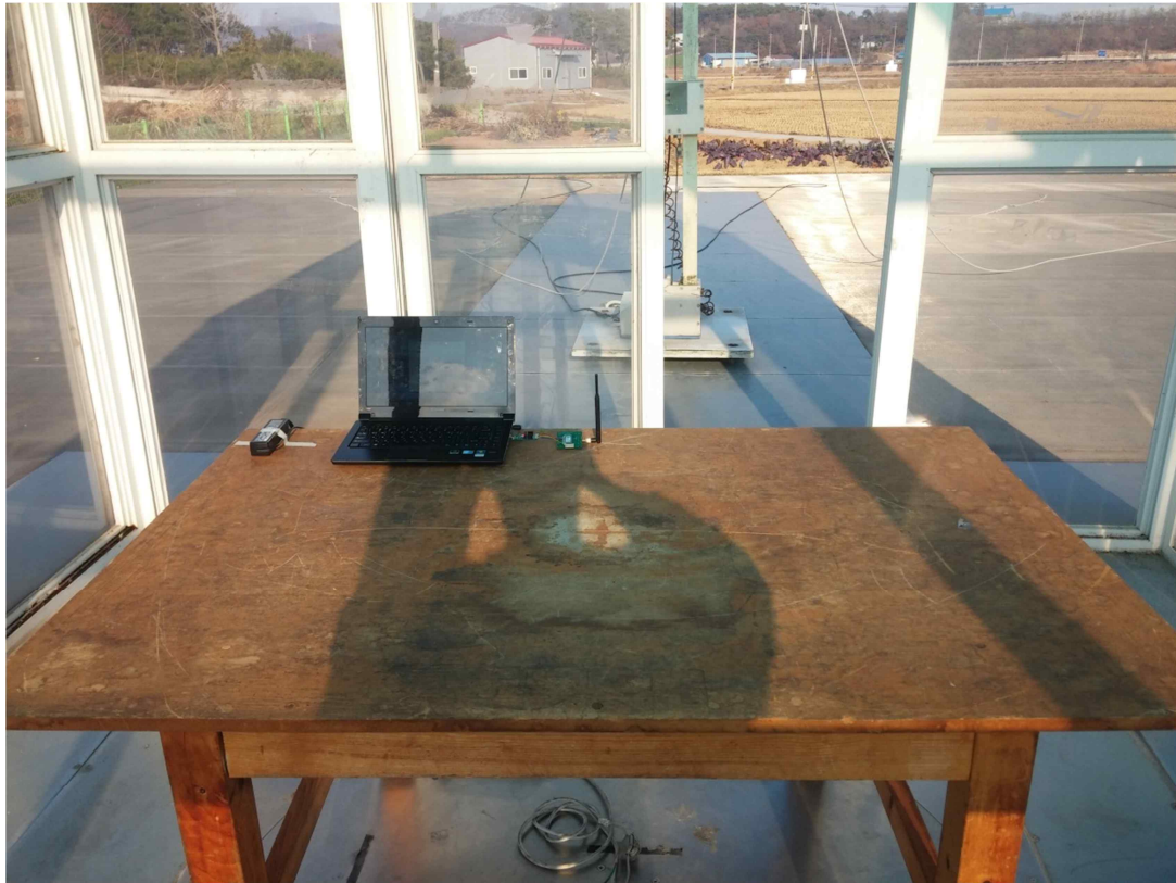
Radiated emission Test (above 1 000 MHz)