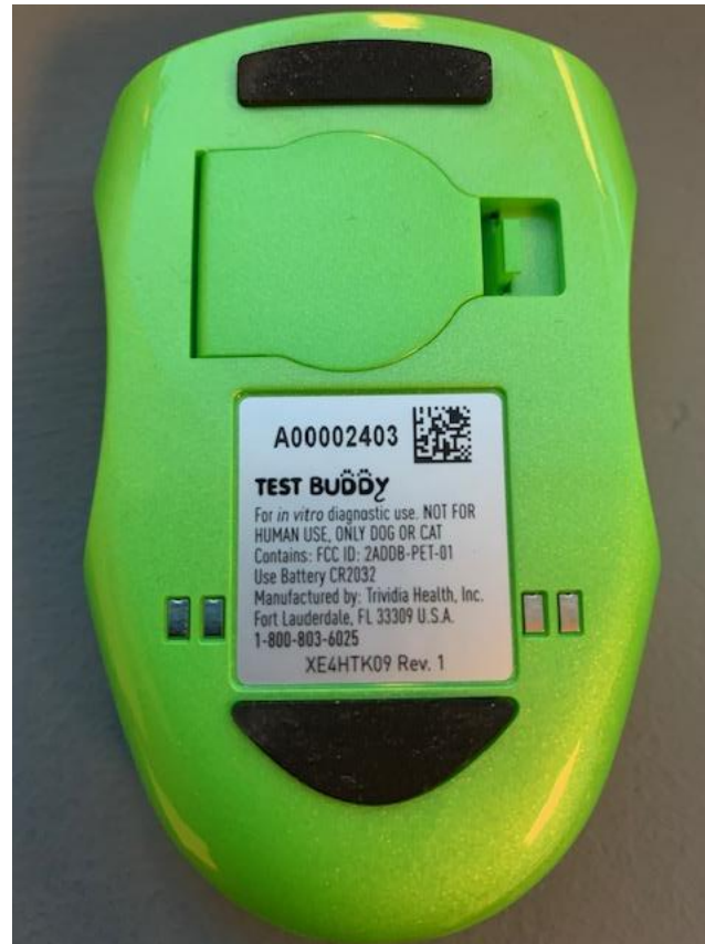
Exhibit 1. Label ID Position on Device