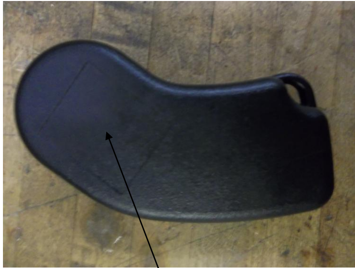
Back of Keyfob