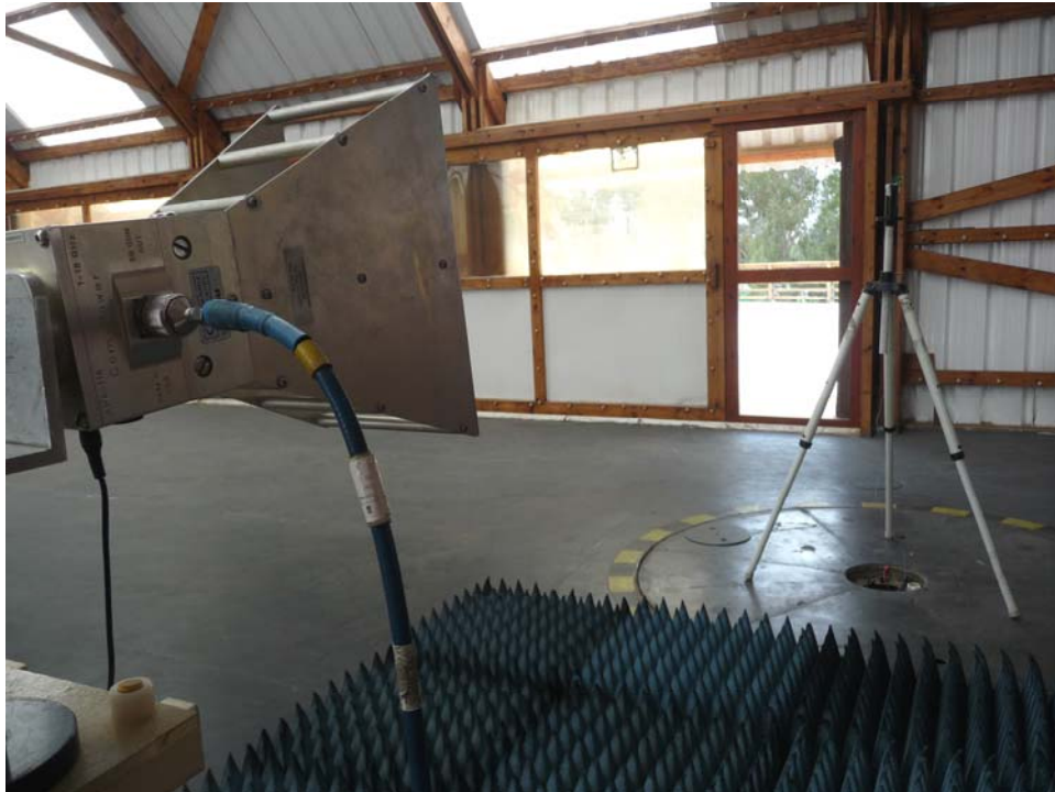
Photograph No.1 Carrier field strength measurement setup