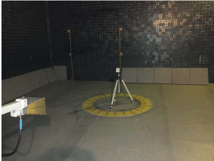
Photograph No.1 Peak output power measurement setup (BLE)