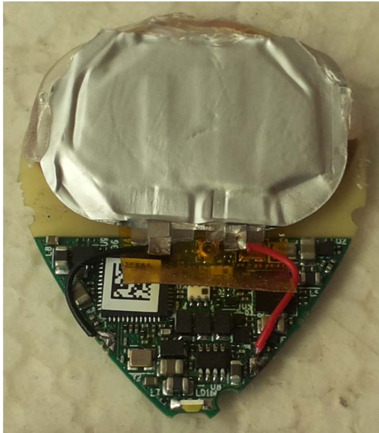
Photograph No.1 PixiePoint tag internal view