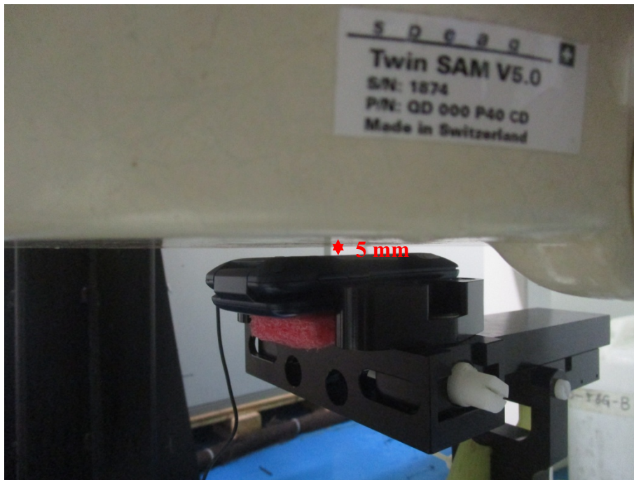
Body Back Setup Photo(5mm)