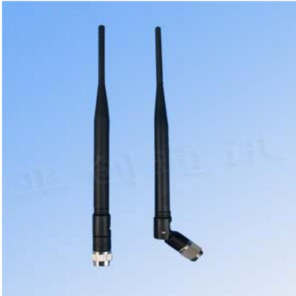
Figure 4. Q8019-900LW Antenna

FCC Part 15 Certification 2AD9R-CO1301 15-0021 February 13, 2015 Controlant EHF CO 13.01