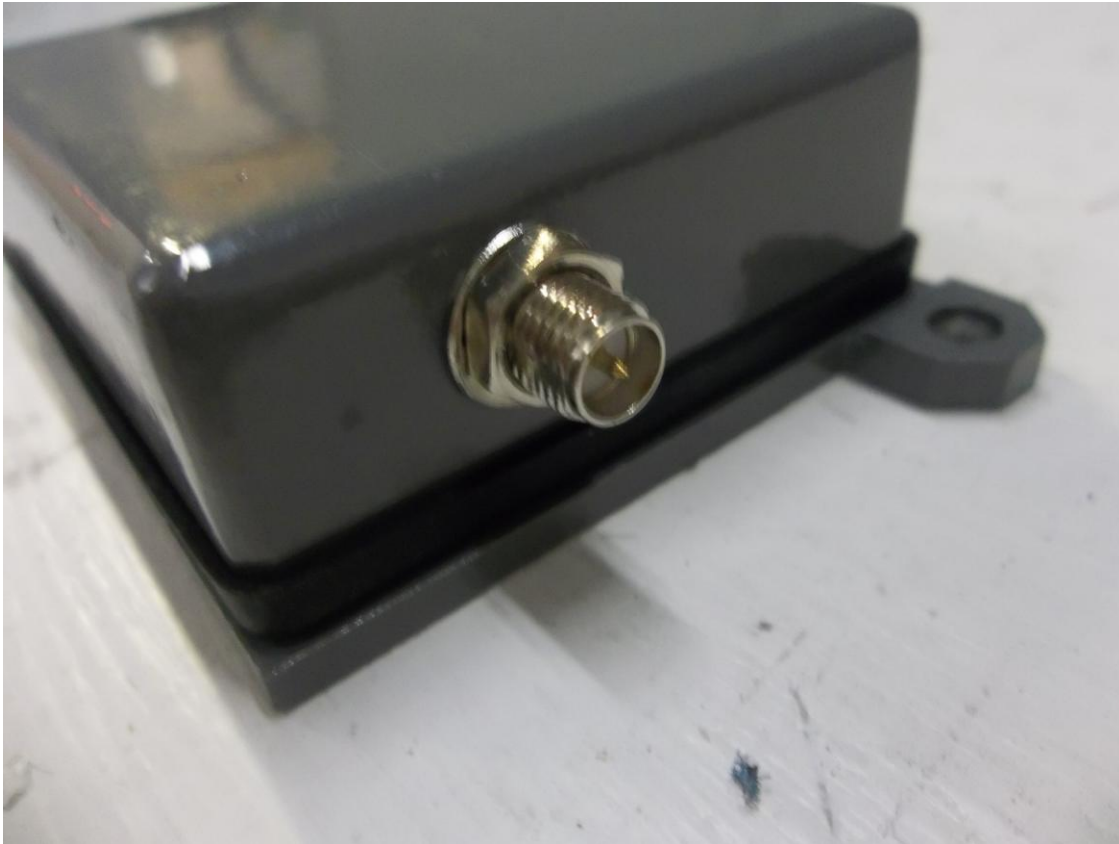
Figure 3. SMA Reverse Sex Connector

FCC Part 15 Certification 2AD9R-CO1301 15-0021 February 13, 2015 Controlant EHF CO 13.01