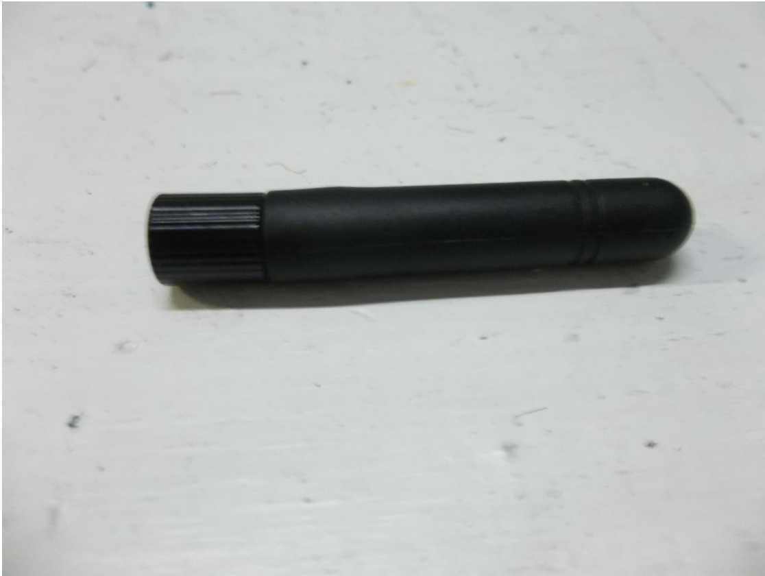
Figure 5. Q868-A AP Antenna

FCC Part 15 Certification 2AD9R-CO1301 15-0021 February 13, 2015 Controlant EHF CO 13.01