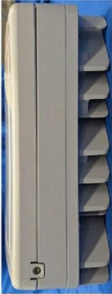
Right Side FA3WA ((xtension Module)