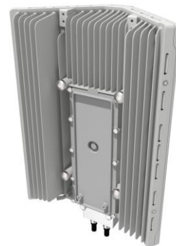
AEWE (extension module)