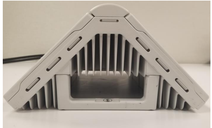
AEWE (extension module)