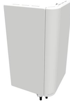
AEWE (extension module)