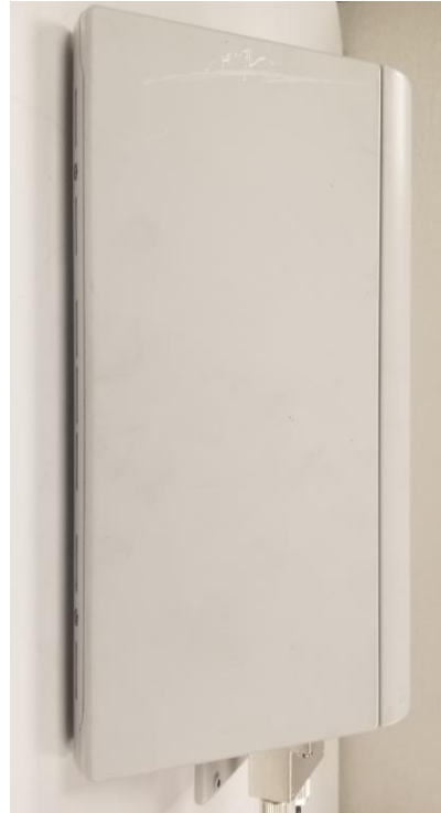
AEWE (extension module)