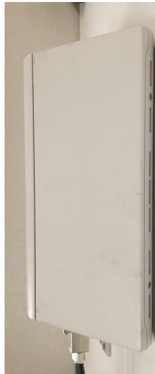
AEWE (extension module)