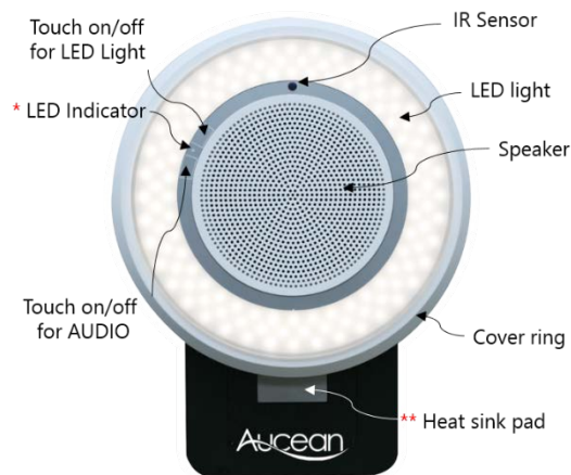
Master Speaker (LEFT Channel)