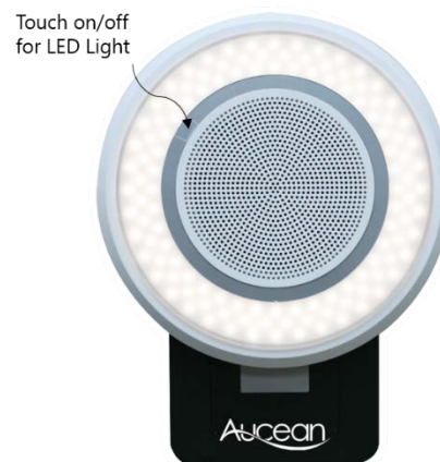
Slave Speaker (Right Channel)

* LED Indication: If ACC power is activated, the blue LED indicator is on.