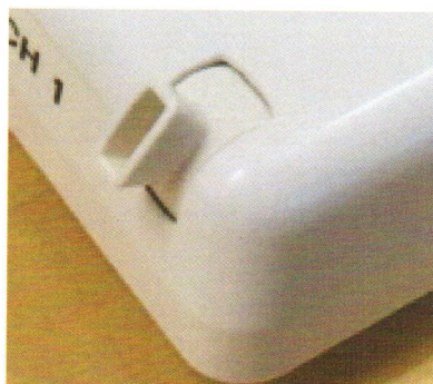
Figure 2 INF-B246-B comes with one omni-directional waveguide (on left) and four waveguides (on right)