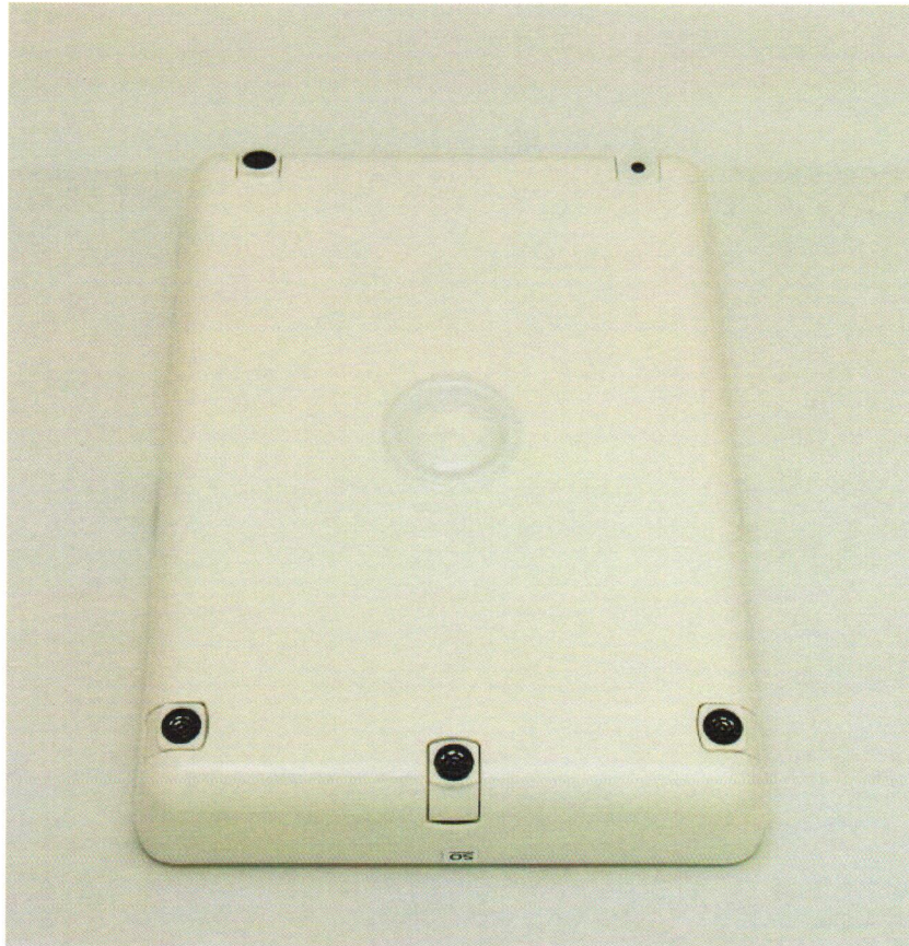
Figure 1 INF-B246-C front with one omni-directional and four directional waveguides.