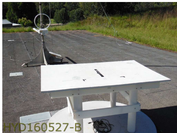
15.209 – Radiated Emissions below 30MHz