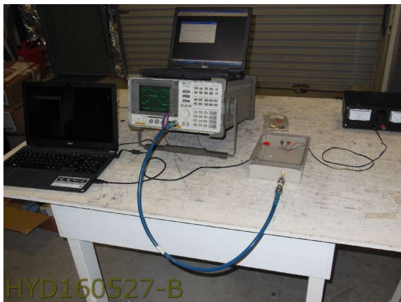
Conducted Measurements – Antenna Port