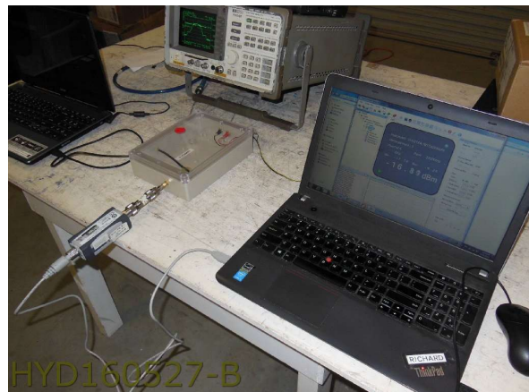
TX Power Measurement – Antenna Port-

This document shall not be reproduced, except in full