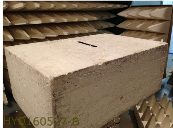
15.209 – Radiated Emissions above 1GHz