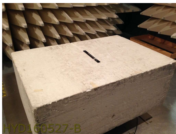
15.209 – Radiated Emissions 30MHz to 1000MHz

This document shall not be reproduced, except in full