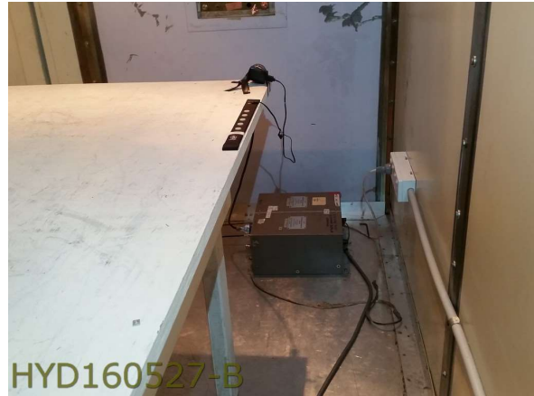
Mains Conducted Emissions

This document shall not be reproduced, except in full