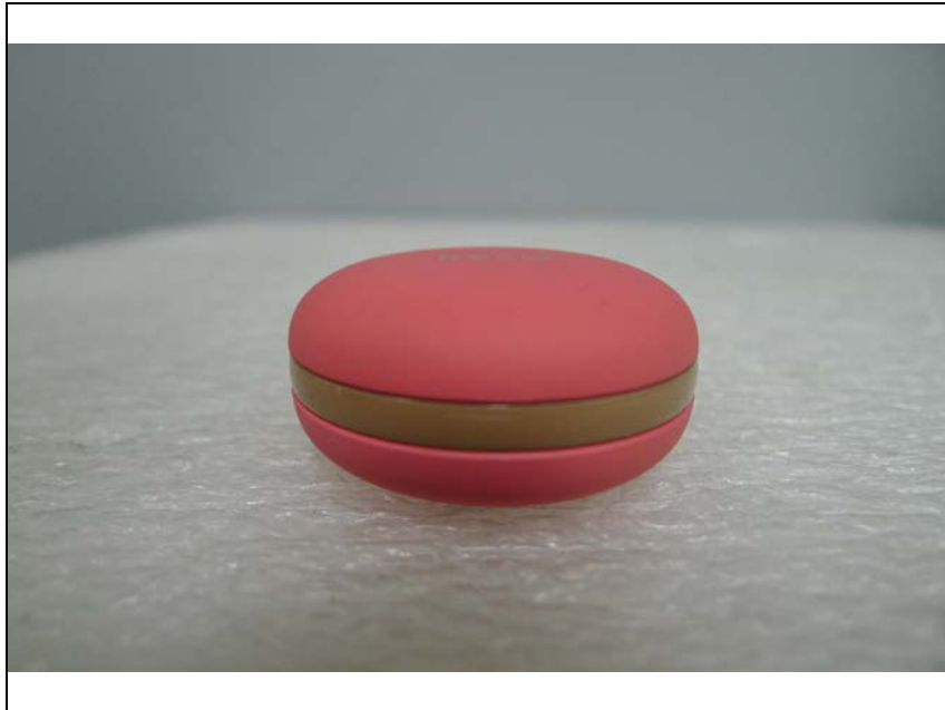
Side view of EUT