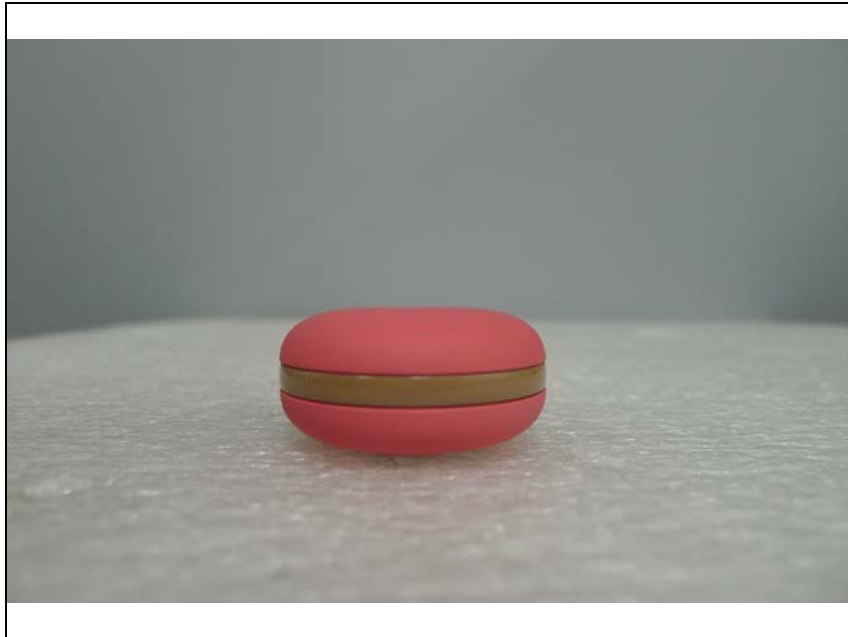
Side view of EUT