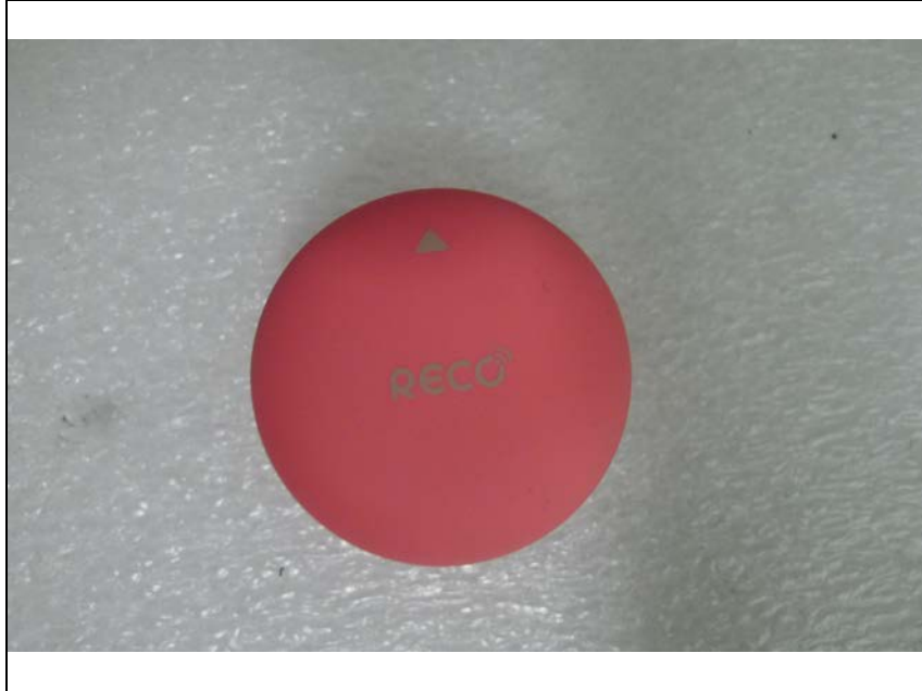
Rear view of EUT