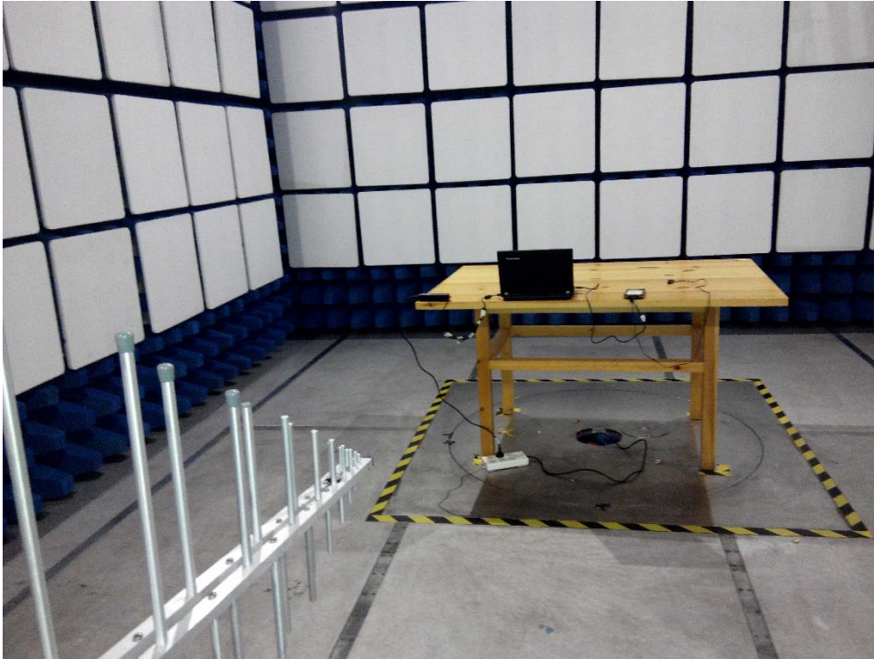
30 MHz-1 GHz (USB test mode)