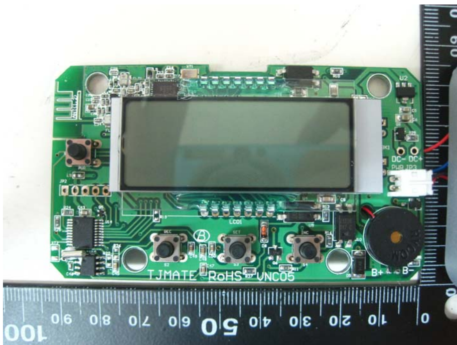
Front View of the EUT's PCB